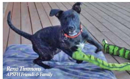
Reno Timmons APSFH Friends & Family

APSFH often reaches out to over-crowded shelters and rescue groups to help save pets who need a second chance finding a home. In return, these same organizations help us when we are overloaded or we run out of options for adoptable pets that have not found their 'perfect island match' family. It is a win-win for all involved especially for the animals.