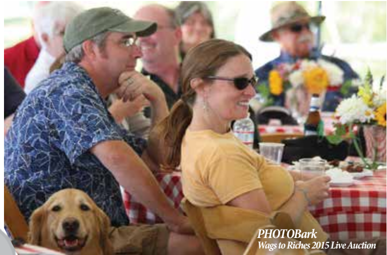
PHOTOBark Wags to Riches 2015 Live Auction

Wags to Riches 2014 was certainly an afternoon to remember. Nearly 200 supporters were treated to Celtic Cowboy's Award Winning BBQ, great local music by the Kubatana Marimba Band and the J-Bots.