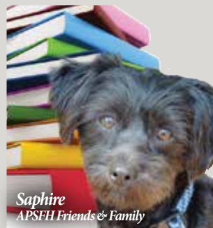
Saphire APSFH Friends & Family

APSFH now has accounts with SECOND ACT and GIRLFRIEND'S CONSIGNMENT for clothing as well as an account for books with SERENDIPITY, THE USED BOOK PLACE.