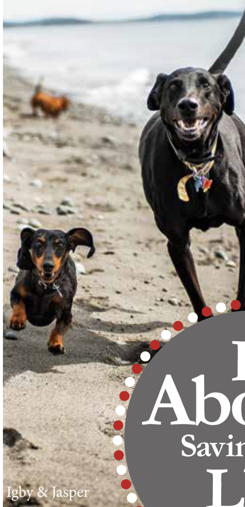
Igby & Jasper