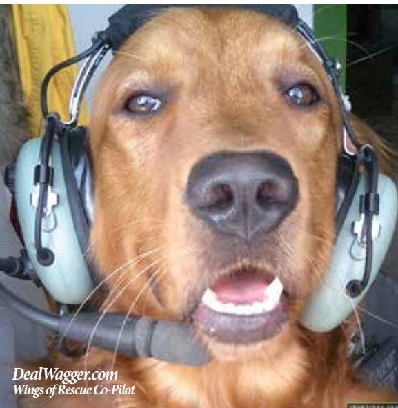
DealWagger.com Wings of Rescue Co-Pilot