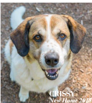
CRISSEY New Home 2015