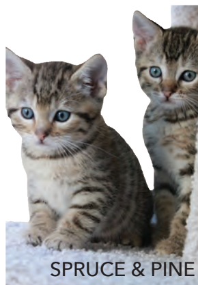
SPRUCE & PINE