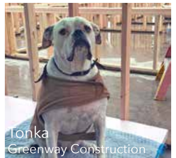
Tonka Greenway Construction