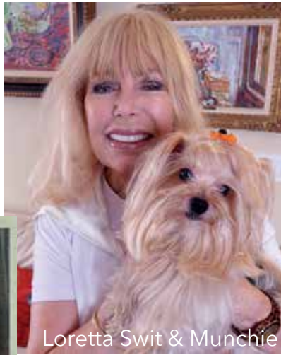
Loretta Swit & Munchie